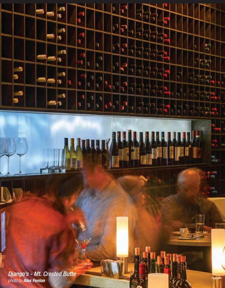
Django's - Mt. Crested Butte

FOR ADVERTISING INFORMATION, CALL Certified Folder Display Service, Inc. (800) 799-7373