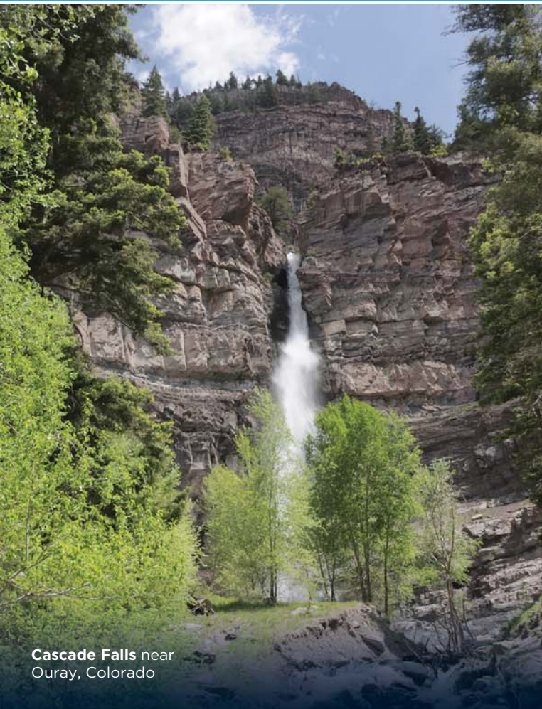
Cascade Falls near Ouray, Colorado

VISITOR SERVICES WATER SPORTS ATTRACTIONS SIGHTSEEING LODGING DINING HELPFUL NUMBERS