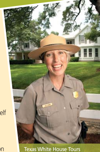
Texas White House Tours

BUT FIRST! Stop by our Visitor Information Center—302 E. Austin. Watch a short video on the area and get more inside info to make your stay memorable.