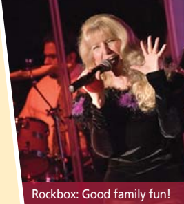
Rockbox: Good family fun!