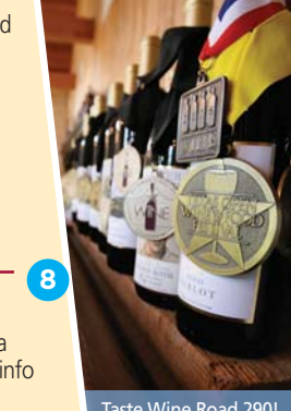
Taste Wine Road 290!